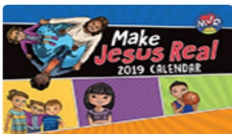
MJR 2019 Calendar