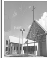
St. John the Baptist