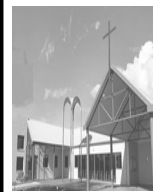
St. John the Baptist

DO NOT LET YOUR HEARTS ♥ BE TROUBLED ♥ trust in God John 14:1