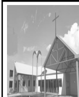
St. John the Baptist