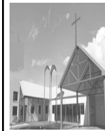
St. John the Baptist