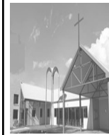
St. John the Baptist