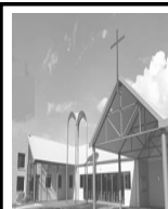
St. John the Baptist

Jesus went off to the other side of the Sea of Galilee - or of Tiberias - and a large crowd followed him, impressed by the signs he gave by curing the sick. Jesus climbed the hillside, and sat down there with his disciples. It was shortly before the Jewish feast of Passover. Looking up, Jesus saw the crowds approaching and said to Philip, 'Where can we buy some bread for these people to eat?' He only said this to test Philip; he himself knew exactly what he was going to do. Philip answered, 'Two hundred denarii would only buy enough to give them a small piece each.' One of his disciples, Andrew, Simon Peter's brother, said, 'There is a small boy here with five barley loaves and two fish; but what is that between so many?' Jesus said to them, 'Make the people sit down.' There was plenty of grass there, and as many as five thousand men sat down. Then Jesus took the loaves, gave thanks and gave them out to all who were sitting ready; he then did the same with the fish, giving out as much as was wanted. When they had eaten enough he said to the disciples, 'Pick up the pieces left over, so that nothing gets wasted.' So they picked them up, and filled twelve hampers with scraps left over from the meal of five barley loaves. The people, seeing this sign that he had given, said, 'This really is the prophet who is to come into the world.' Jesus, who could see they were about to come and take him by force and make him king, escaped back to the hills by himself.